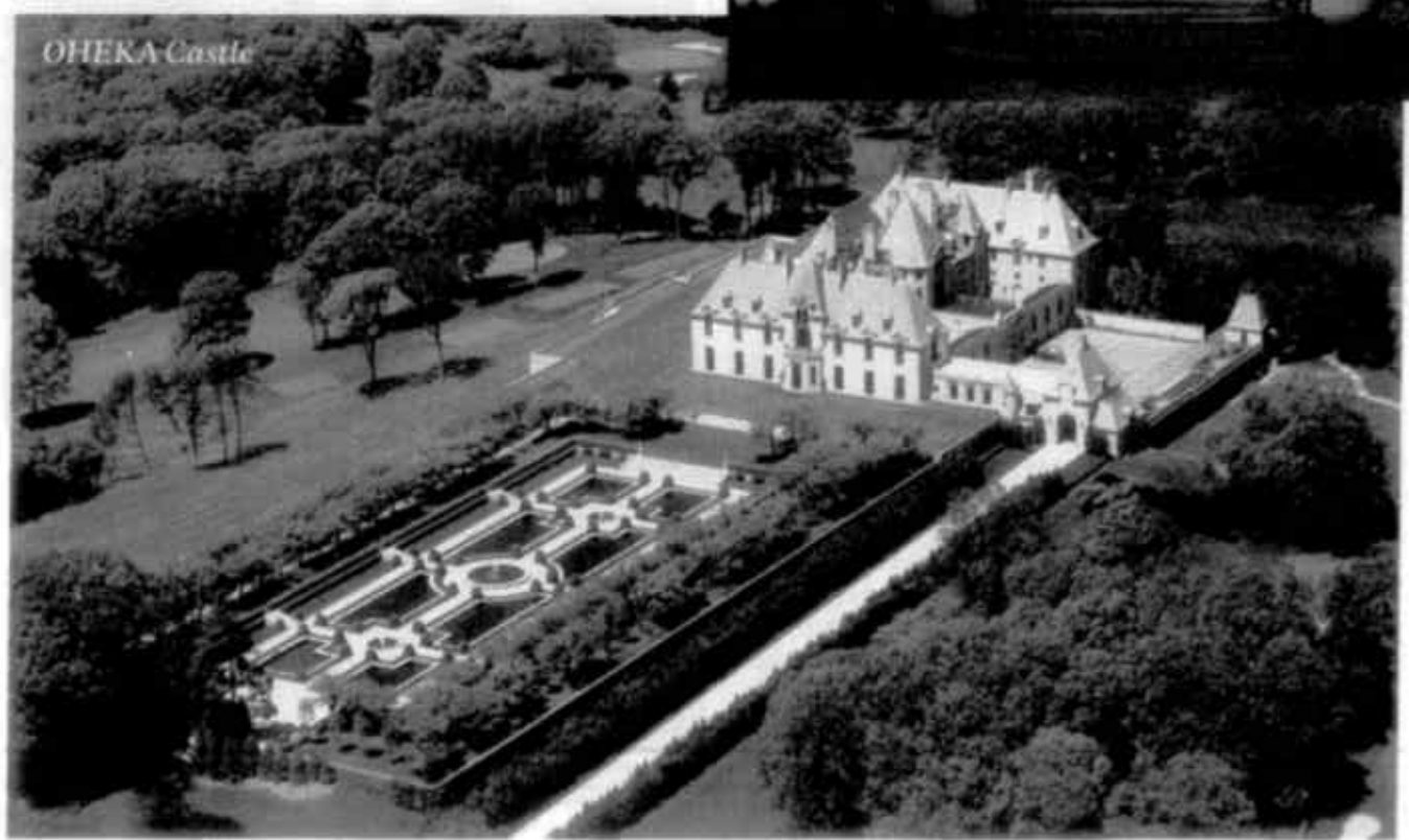
Kahn/Bildt; Rev. Meyerson; Landscape