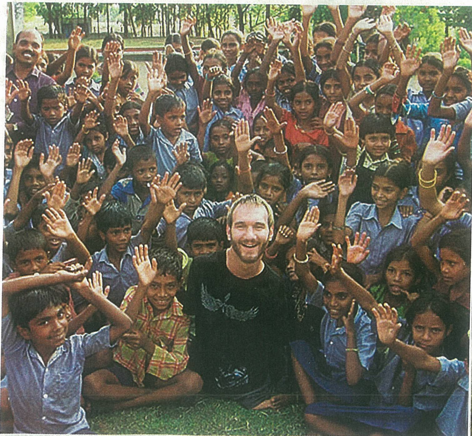
INTERNATIONAL INSPIRATION Following a motivational talk and an impromptu game of soccer, Vujicic poses for photos with students while on a mission trip in Surat, India.

The son of a pastor and a nurse, Vujicic was born on Dec. 4, 1982 in Melbourne, Australia. Without warning, Vujicic came into the world